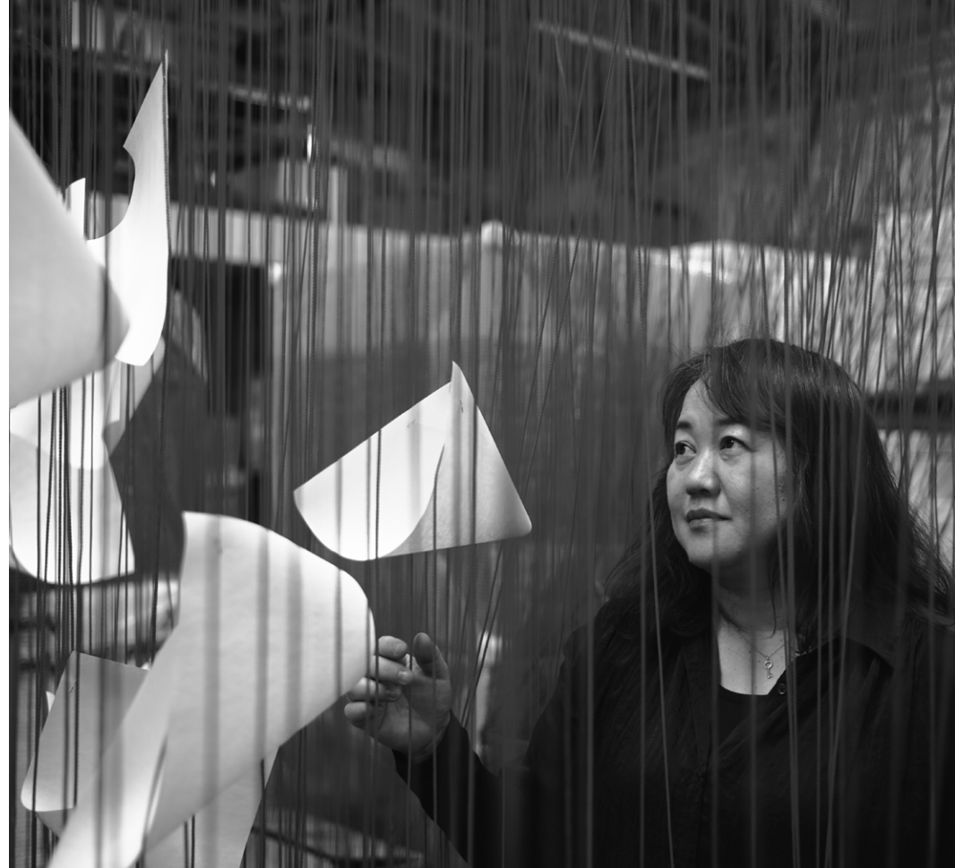
Chiharu Shiota (Berlin, 2024)