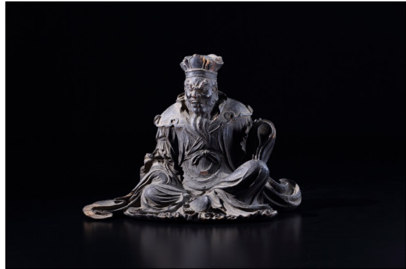
Statue of King Enma, Edo Period (1603-1868)

Kamakura-bori is a traditional woodcraft from Kanagawa Prefecture. Enjoy exquisite examples of this carving art, which is known for being a practical craft with impressive carving and rich urushi finishes.