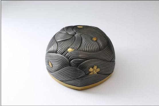
Pentagonal box (Sakura floating in the water)